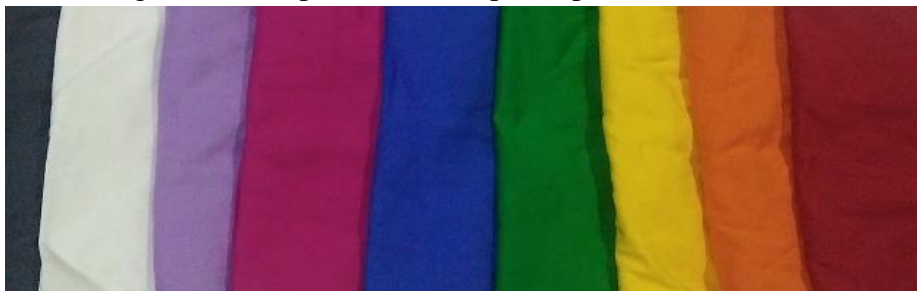
Figure 1 Color Variety of Cotton Fabrics Used in This Study

The clothing material used in this study is cotton fabric with 10 color variations. The colors used are black, gray, white, purple, pink, blue, green, yellow, orange, and red. Each fabric has the same specifications in terms of thickness and gram weight. The tool used is a set of ultraviolet (UV) meters, Tenmars TM-213 type, with a grab range of wavelengths of 290-390 nm and a measurement range of intensity of 4000 \mu\text{W}/\text{cm}^2 and 20 \text{mW}/\text{cm}^2 along with a computer with adequate specifications.