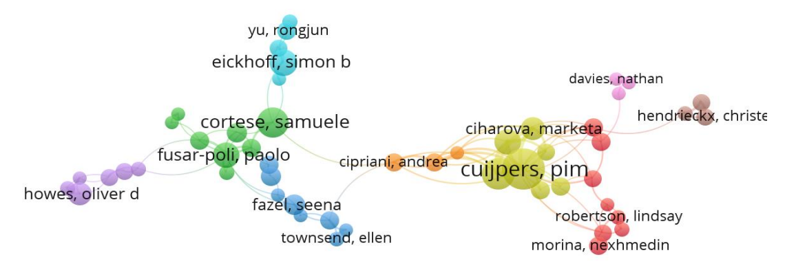
Figure 1. Journal Author Analysis

Data analysis was carried out using Vos Viewer software. Journals from the Scopus database were collected, and this research filtered the journals into 100 journals, which were used for data analysis. The following are the results of the data analysis.